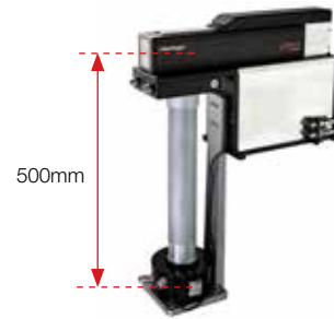
BeamWatch Integrated with 500mm distance between focus position and power meter