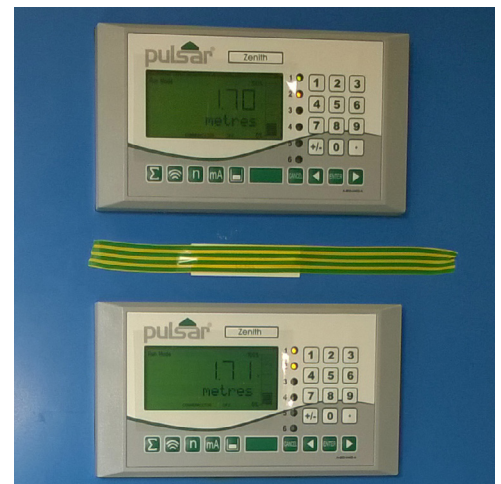
Pulsar Measurement Zenith controller in a real-life panel.

The rear connectors include an RS232 port local for uploading and downloading of stored information via Pulsar Ultra PC Software, part of PC Suite, and an RS485 connection for optional communication purposes.