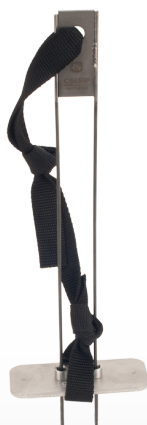
CS650G Rod Insertion Guide