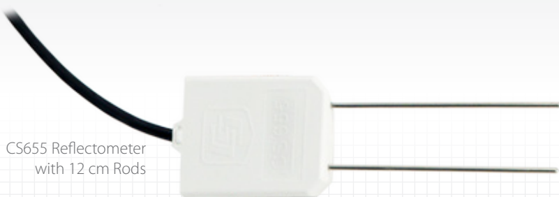
CS655 Reflectometer with 12 cm Rods