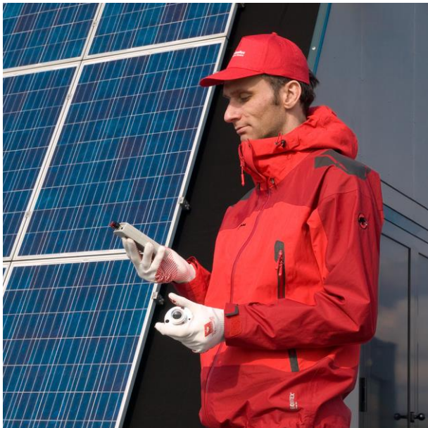
Figure 4 LI19 used with a pyranometer in a field measurement campaign