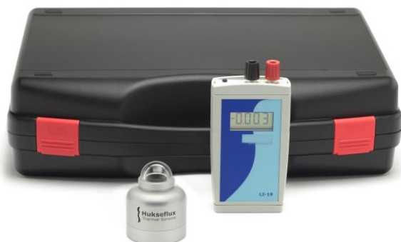
Figure 2 SR05-LI19 as it is delivered, in a practical transport case