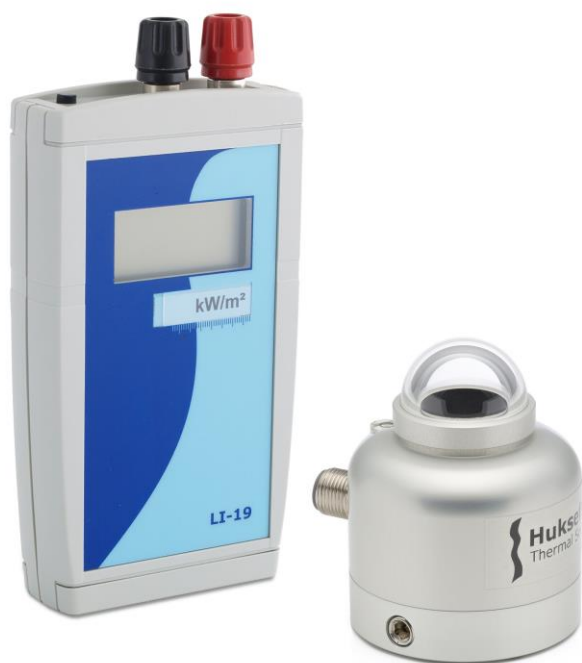
Figure 1 SR05-A1 pyranometer with LI19 handheld read-out unit / datalogger

SR05 is a solar radiation sensor that is applied in most common solar radiation observations. SR05-A1, with analogue millivolt output, complies with the spectrally flat Class C specifications of the ISO 9060 standard and the WMO Guide. LI19 is a high-accuracy handheld read-out unit / datalogger. The SR05-LI19 combination is well suited for mobile measurements and short term datalogging.