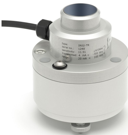
Figure 1 IR02-TR pyrgeometer with heater and 4-20 mA transmitter

IR02-TR is a pyrgeometer suitable for longwave irradiance measurement in meteorological applications. The instrument can be heated, which improves measurement accuracy as it prevents dew deposition on its window. IR02-TR houses a 4-20 mA transmitter for easy read-out by dataloggers commonly used in the industry.