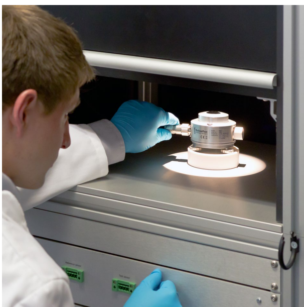
Figure 4 pyrometer during conformity assessment

Calibration of pyrometers used for downward longwave radiation is traceable to the World Infrared Standard Group (WISG). This calibration takes into account the spectral properties of downward longwave radiation. As an option, calibration can be made traceable to a blackbody and the International Temperature Scale of 1990 (ITS-90). This alternative calibration is appropriate for measurements of upward longwave radiation (with IR02 pyrometers facing down).