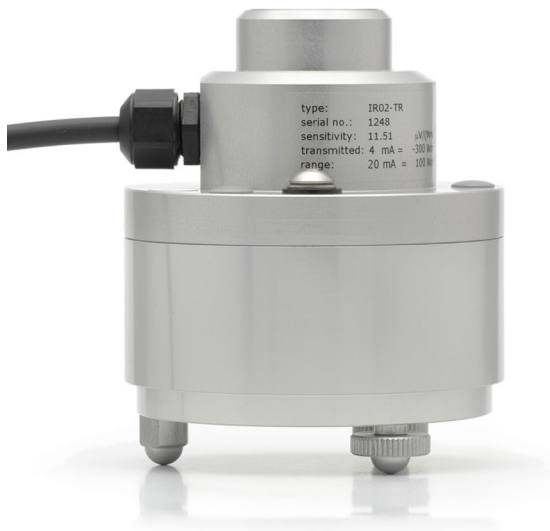
Figure 3 IR02-TR with heater and 4-20 mA transmitter