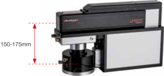
BeamWatch Integrated with 150-175mm distance between focus position and power meter